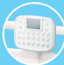
Nurse Control Digital Scale