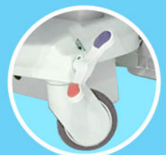
Covered Caster with TUV Certified