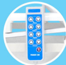
Easy Interface Remote Control