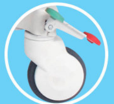
Covered Caster with TUV Certified