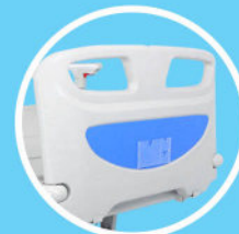
Board in Poly-propylene easy to clean up